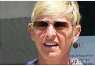
They couldn't believe what she revealed ...

We received escalations from publishers about ads promoting misleading information/sites.